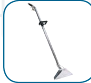
10-0861 12" S/S Dual Jet S-Bend Wand