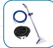
80-0500 Hoses and Wand Kit