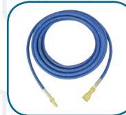
80-0502 25 ft. Solution Hose Assembly