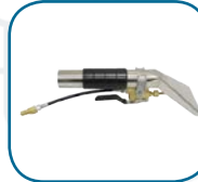
10-0501 4" S/S Upholstery Tool