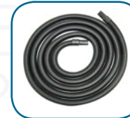
80-0503 25 ft. Vacuum Hose with Cuffs Assembly

SNIPER CARPET EXTRACTOR 12-Gallon Carpet Extractor Series