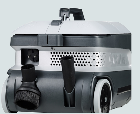
User friendly and easy to reach accessories