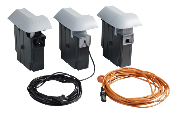
The modular VP600 allows flexibility to choose exactly what cord you need: standard, detachable or cord rewind

The modular design not only allows flexibility to choose exactly what you need but it also makes the machine easy to maintain and service for years to come. When a cord is worn out or damaged, it can easily be replaced by a new cord module in no time, providing you with a machine that need never be out of service.