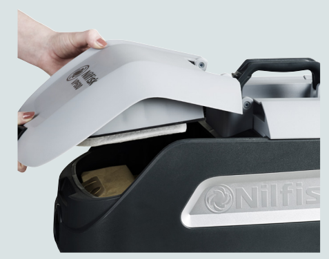
HEPA H13 exhaust filter is standard on all VP600 variants