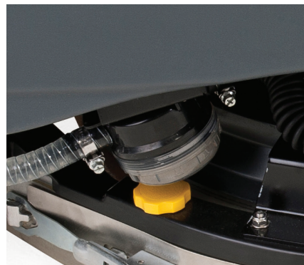
Externally mounted solution filter allows operators to easily clean the filter and manage the solution level.