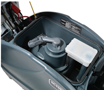
Flip-up lid and tilt-back tank provides easy access to the recovery tank, debris catch cage, batteries and EcoFlex™ cartridge.

Schools and Universities Entertainment Arenas Hospitals and Healthcare Facilities Grocery Stores Office Buildings Retail Outlets Sports Centers