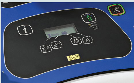
Simple, intuitive controls minimize operator training.

Clean green and still meet the highest expectations for clean floors with the standard onboard EcoFlex System™. The EcoFlex System controls the consumption of detergent so effectively that real savings can be gained without compromising performance. With a single button, effortlessly switch between chemical-free cleaning or select from weak to strong cleaning intensities to match cleaning performance to the soil on the floor and the required level of clean. More soil? No problem. Activate the "burst of power" for extra cleaning performance and easily return to the original settings for minimum usage of water, detergent and power.