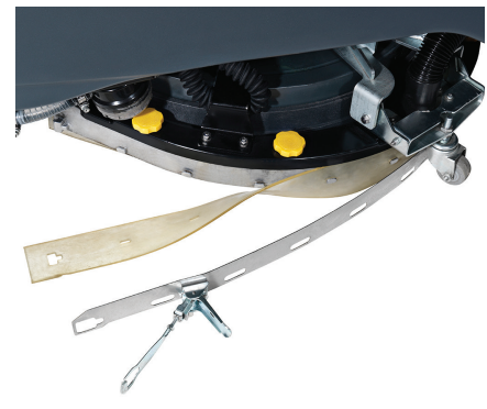
Squeegee wraps around the deck for 100% water pick-up and simply clips onto the bracket with no thumb nuts or adjustment required.