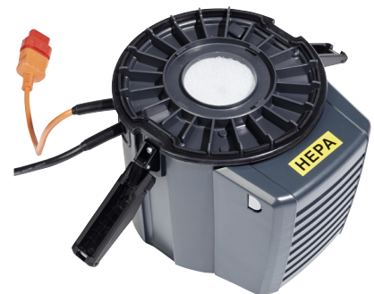
Easy to install HEPA exhaust filter as standard