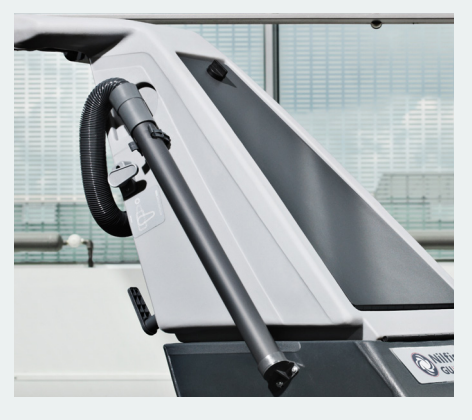
Simple controls and low profile design make operating the unit easier and safer

8 brush height positions for effective cleaning of all carpet types